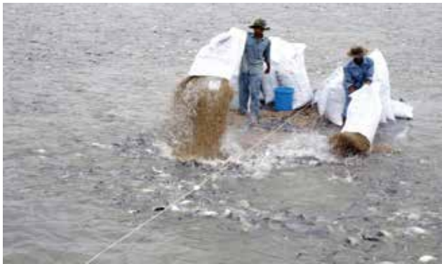
Saline intrusion cannot be prevented, so the best solution is accelerating the salinization process to serve aquaculture.

In the Mekong Delta, one of the largest key agriculture production zones in the country, alkaline soil accounts for 18.6 percent of total area, located along the East Coast belt and the Gulf of Thailand. In the context of climate change, desalinizing is an impossible mission, or will be too costly.