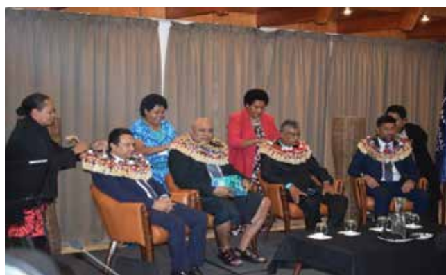
Garlanding of guests during opening of the workshop.

The Centre on Integrated Rural Development for Asia and the Pacific (CIRDAP) and the National Institute of Rural Development and Panchayati Raj (NIRD&PR) have successfully conducted the international training programme on 'Geospatial Information Management in Rural Development' during 13-22 November 2017 at Hyderabad, India. This training was organized to focus on the Asia-Pacific trends of Geospatial