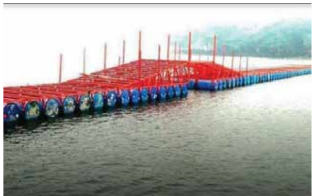
This floating bridge, meant for easing communication from Jhampa village to Manirampur upazila headquarters of Jessore.

Jhampa Village Development Foundation comprising 56 youths conducted the work with the spontaneous help of the villagers.