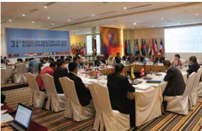
EC-31 in progress.

The EC Members of the Philippines and Fiji were unanimously elected as the Chairperson and the Vice Chairperson of EC-31 respectively for the period starting from EC-31 Meeting till the election of new Chairperson and Vice Chairperson at the next EC meeting (EC-32).