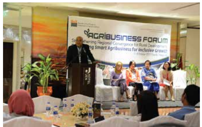
DG CIRDAP delivering his speech in the Agribusiness Forum programme during 11-12 October 2017.