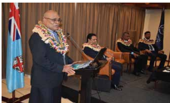
DG CIRDAP addressing his speech emphasising on leadership.