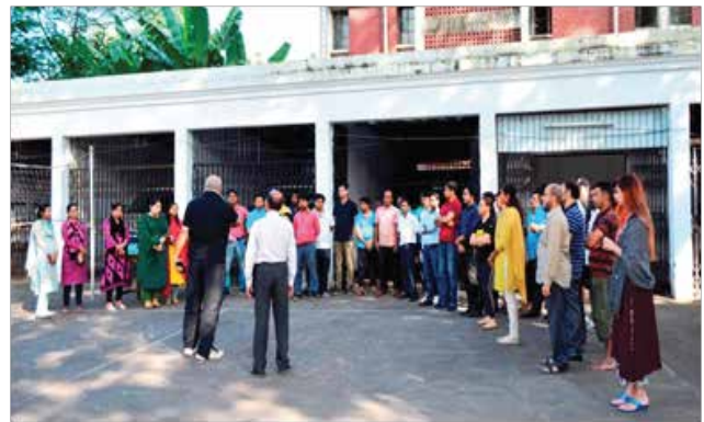
DG CIRDAP giving instruction on cleaning among staffs.

An in-house cleaning day in CIRDAP was arranged on 02 November 2017 to keep campus premise neat and clean. All professional and general staff of CIRDAP participated in the cleaning spontaneously. After cleaning works, different sports were also organized. At the beginning of cleaning, briefing the importance of green and clean campus, Director General of CIRDAP gave instructions to staff [right photo shows] what should be followed during cleaning.