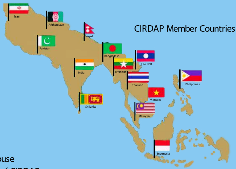
Chameli House The Headquarter of CIRDAP