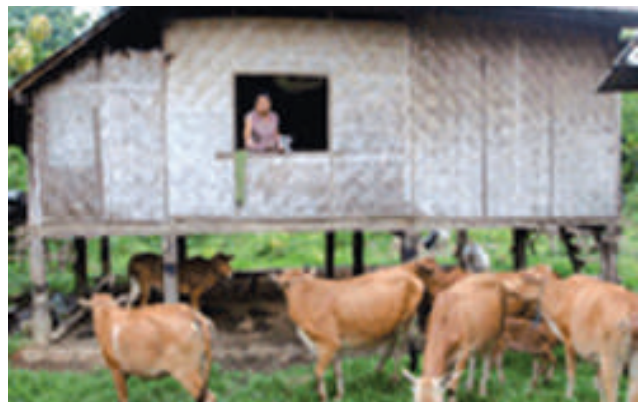
Raising animals for sale helps rural families to rise out of poverty.