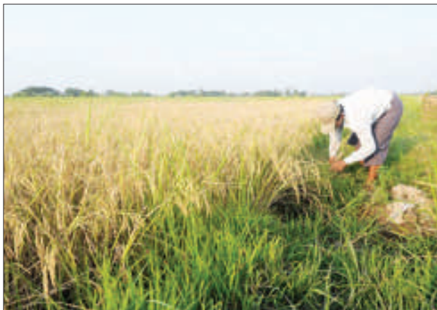
Dressed in Chelsea football shorts and a wide-brimmed hat, U Than Tun toils away in his paddy field on the outskirts of Yangon, sweat pouring down his sinewy arms.

The quasi-civilian reformist government, which took over from the military in 2011, is determined to resurrect the country's reputation as a rice producer. But rotting stocks, creaking infrastructure, heavily indebted farmers and minimal foreign investment are among the hurdles it faces. Still, many economists believe helping farmers like U Than Tun offers Myanmar one of the fastest ways to both alleviate poverty and turn around the country's fortunes.