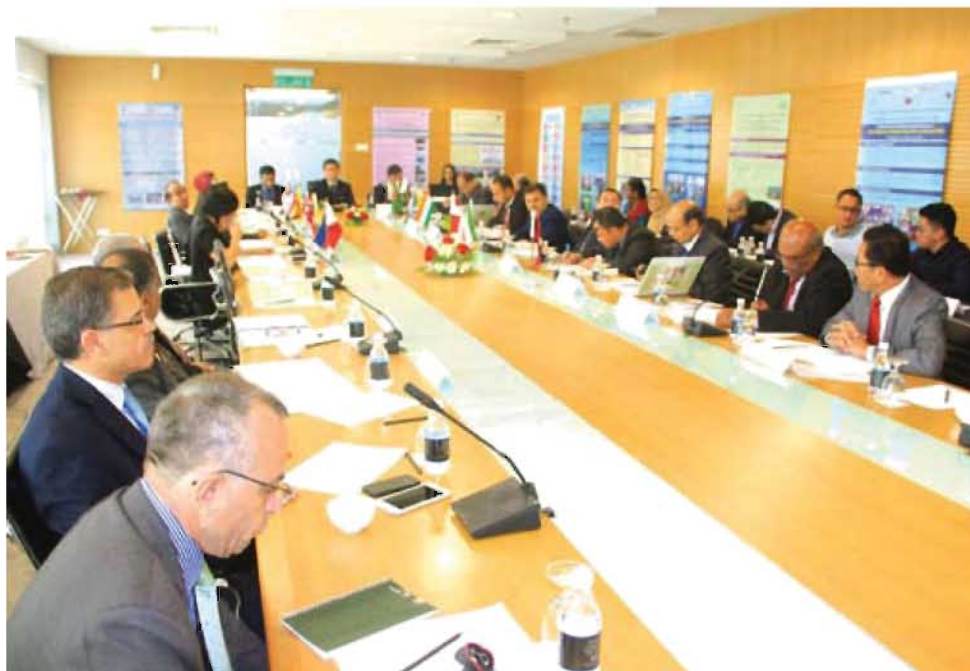
TC-31 in progress

3.4 Dr. D.P. Paudyal, the former DG of CIRDAP, informed the forum that RCF was created for the purpose of capacity development of the CLIs. It was also expected to strengthen