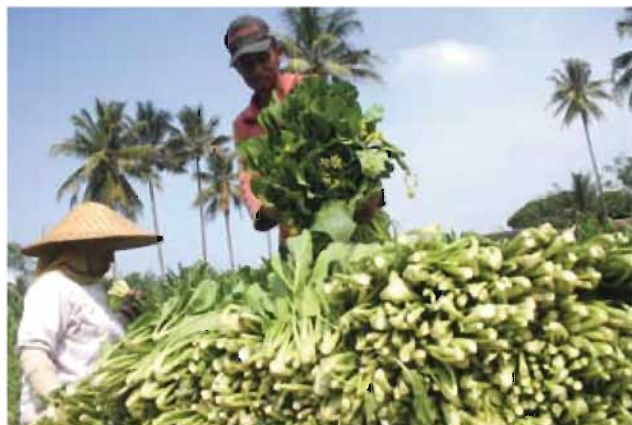
Farmers harvest cabbage in Bokor village, one of main producers of vegetables in Malang, East Java.

Meanwhile, Trade Minister Mr. Thomas Lembong said his ministry had estimated that the online system would benefit farmers and consumers. He announced an optimistic projection that the farmers would see a 15 per cent increase in their agricultural product profit margins.