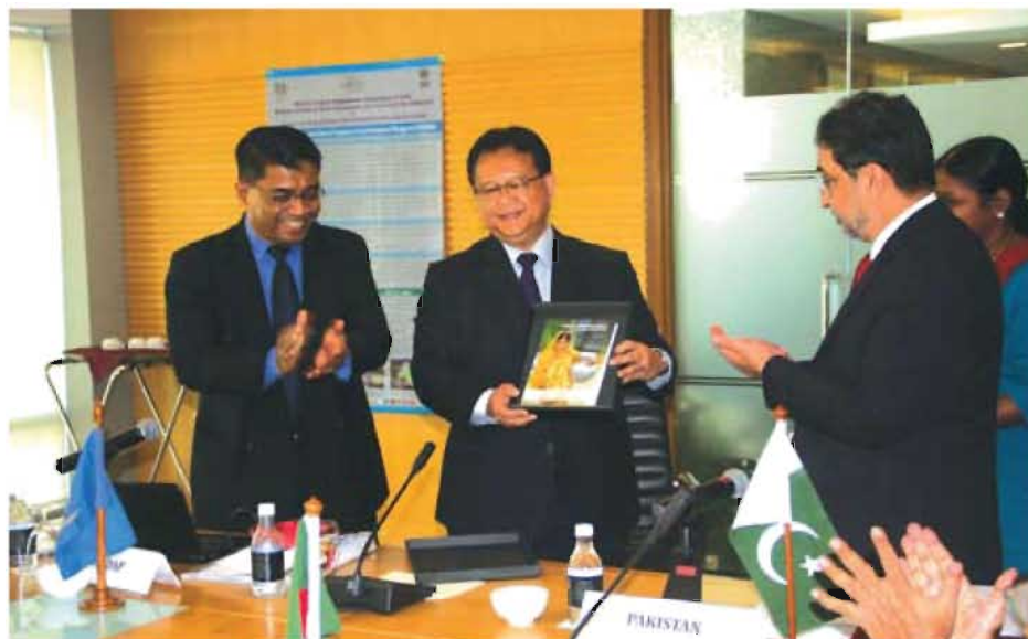
CIRDAP publications were released during the TC-31