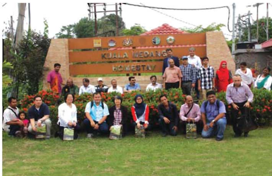
TC-31 Members on a field visit to Home Stay, a best practice of Malaysia

It was suggested if a new country join, they will be the host of the TC meeting after completing the above schedule.