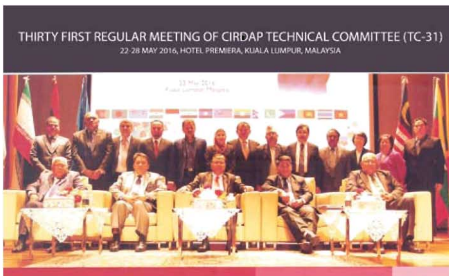
Members with the Chief Guest of the TC-31, Honorable Datuk Alexander Nanta Linggi, Deputy Minister of Rural and Regional Development, Malaysia

3.2 The Philippines delegate viewed that it was necessary to get clarifications on items 14 and 15 as per TC-29 suggestions. She sought clarification on the standard template