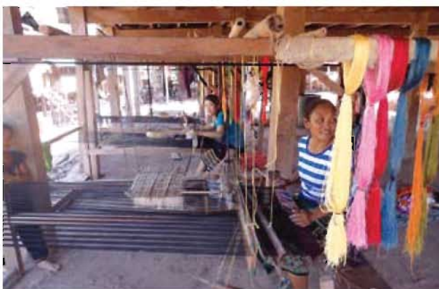
Weaving textiles for sale boosts incomes for rural families.