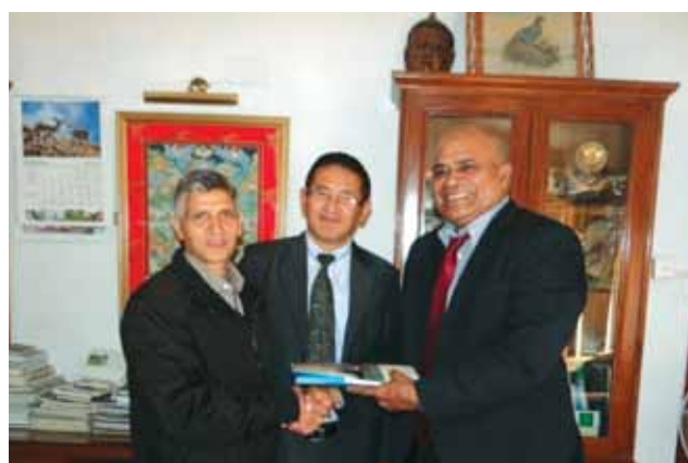
DG CIRDAP had a discussion on productive joint programme with the Chairman, Asia Network of Sustainable Agriculture and Bioresources (ANSAB) in Kathmandu, Nepal on 12 December 2016.