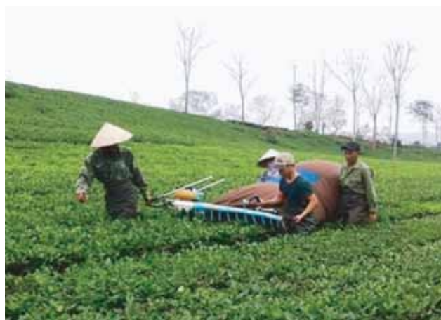
Farmers harvest tea in Phu Tho province.

How to ensure that there are no hungry people in Pakistan is a question to which we must find an answer — and the clock is ticking toward 2030, the year world leaders agreed would be the deadline to reach zero hunger and 16 other sustainable development goals.