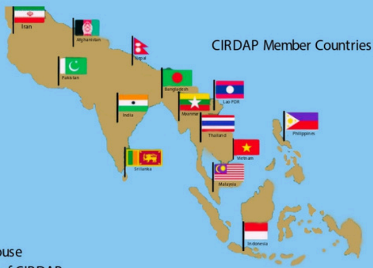
Chameli House The Headquarter of CIRDAP