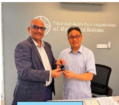
With H. E. FAO Representative of Bangladesh