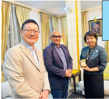
With H. E. Ambassador of Thailand