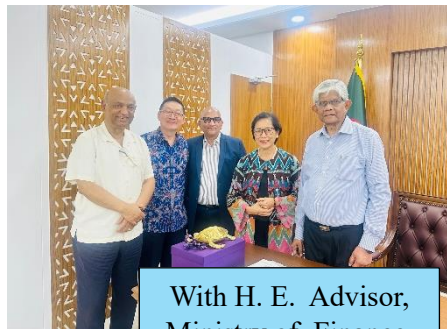
With H. E. Advisor, Ministry of Finance, Bangladesh