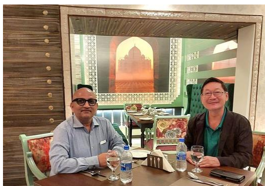
Cordial Moments of Director Generals