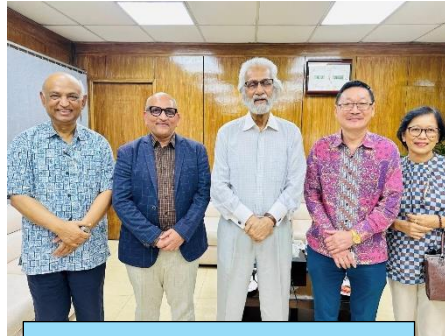
With H.E. Governing Council Chair (Bangladesh)