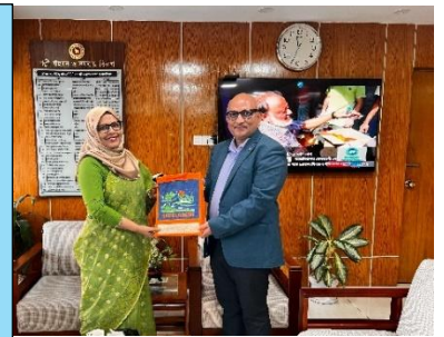
With H. E. Secretary of Rural Developme nt and Co- operatives Division, Bangladesh