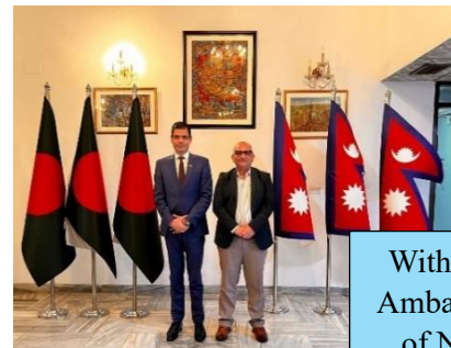
With H. E. Ambassador of Nepal