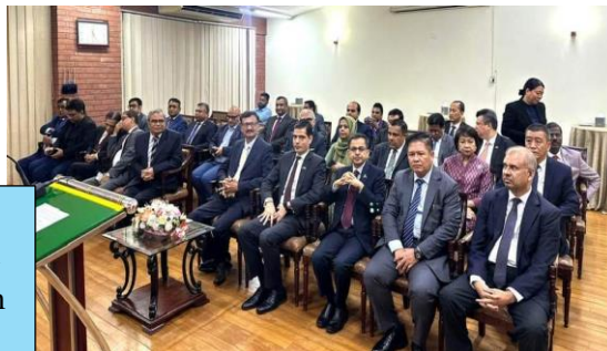
Attended BIMSTEC Foundation Day