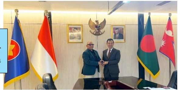
With H. E. Ambassador of Indonesia