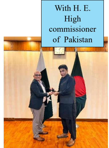
With H. E. High commissioner of Pakistan