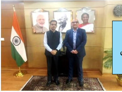
With H. E. High commissioner of India