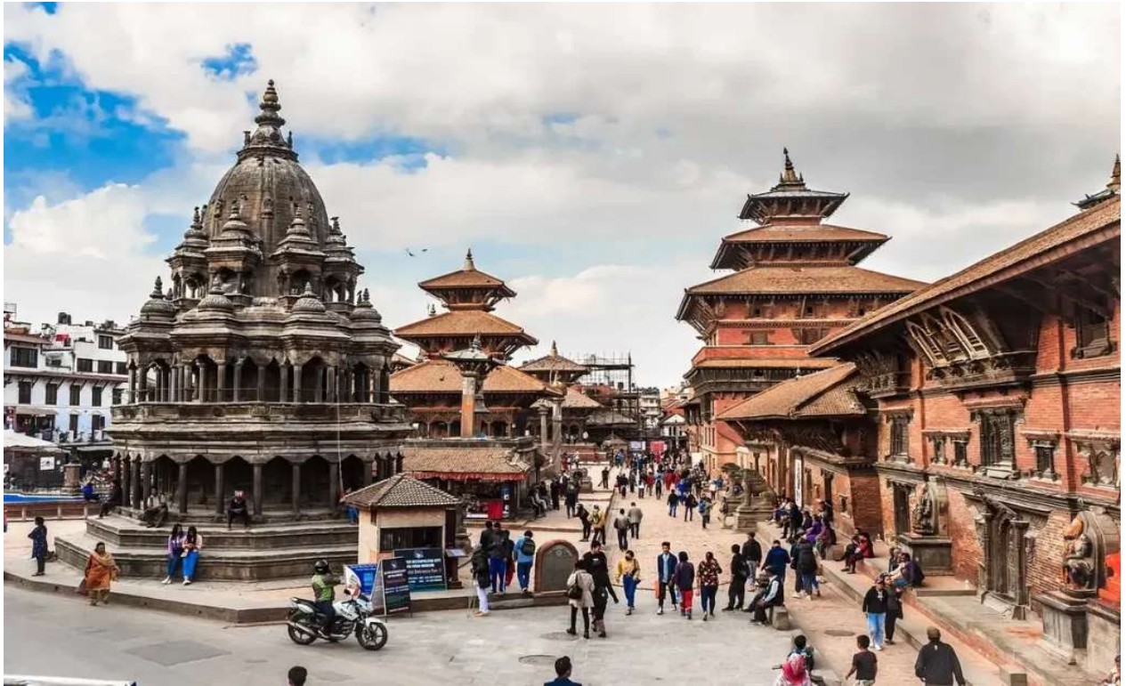
Patan Durbar Square