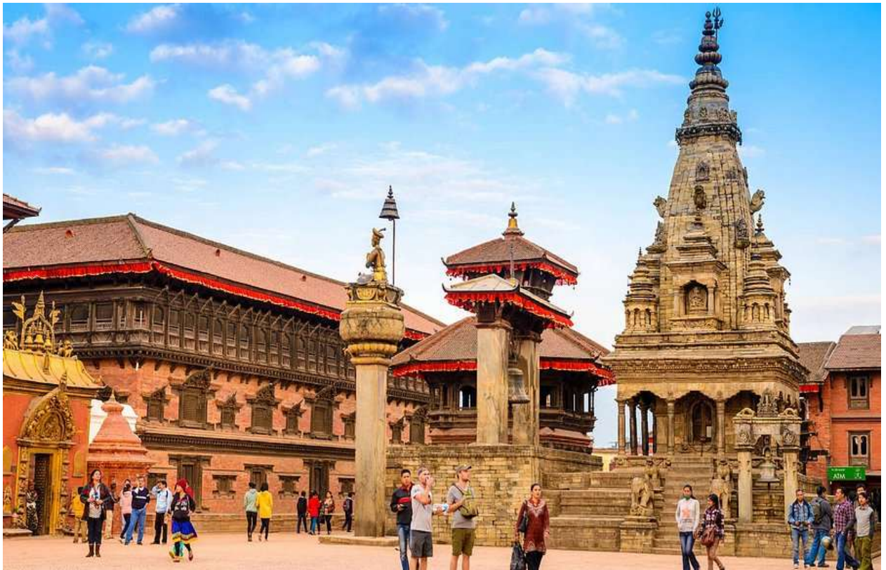
Bhaktapur Durbar Square