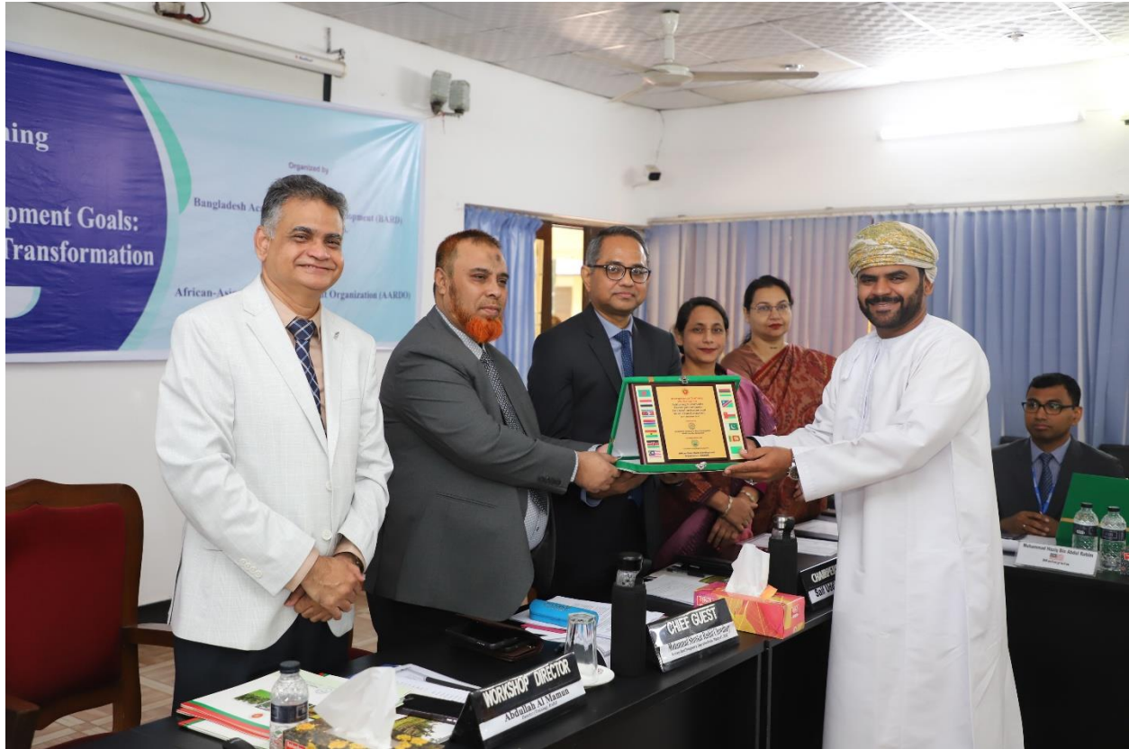
Certificate Award Ceremony of AARDO international Training Programme

The Academy's present initiatives strongly align with the Government of Bangladesh's national development priorities and the Sustainable Development Goals (SDGs). If appropriately nurtured and scaled, these initiatives hold the potential to evolve into future models of rural transformation.