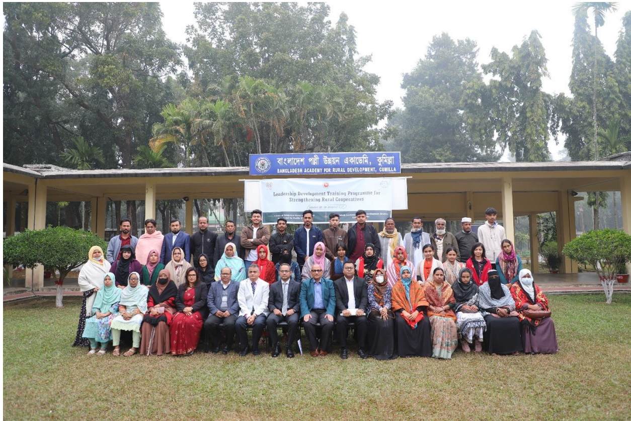
Group photo of international training programme on ‘Leadership Development Training Programme for Strengthening Rural Cooperatives’ organized collaboratively by BARD and CIRDP

In addition, every year, BARD, in collaboration with the African-Asian Rural Development Organization (AARDO), jointly organizes an international training workshop titled “Achieving Sustainable Development Goals: Financial Inclusion and Rural Transformation.” BARD has also been implementing the Saemaul Plus End Poverty Program (SPEPP) in partnership with the Korea International Cooperation Agency (KOICA), drawing upon global best practices to promote sustainable rural development. Moreover, BARD organizes international research conference with the collaboration of INSEARCH every year. These strategic international partnerships have significantly strengthened BARD’s institutional capacity and are expected to pave the way for more innovative, inclusive, and impactful development interventions in the years ahead.